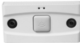
FLIR Brickstream 3D+

www.flir.com/peoplecounting NASDAQ: FLIR